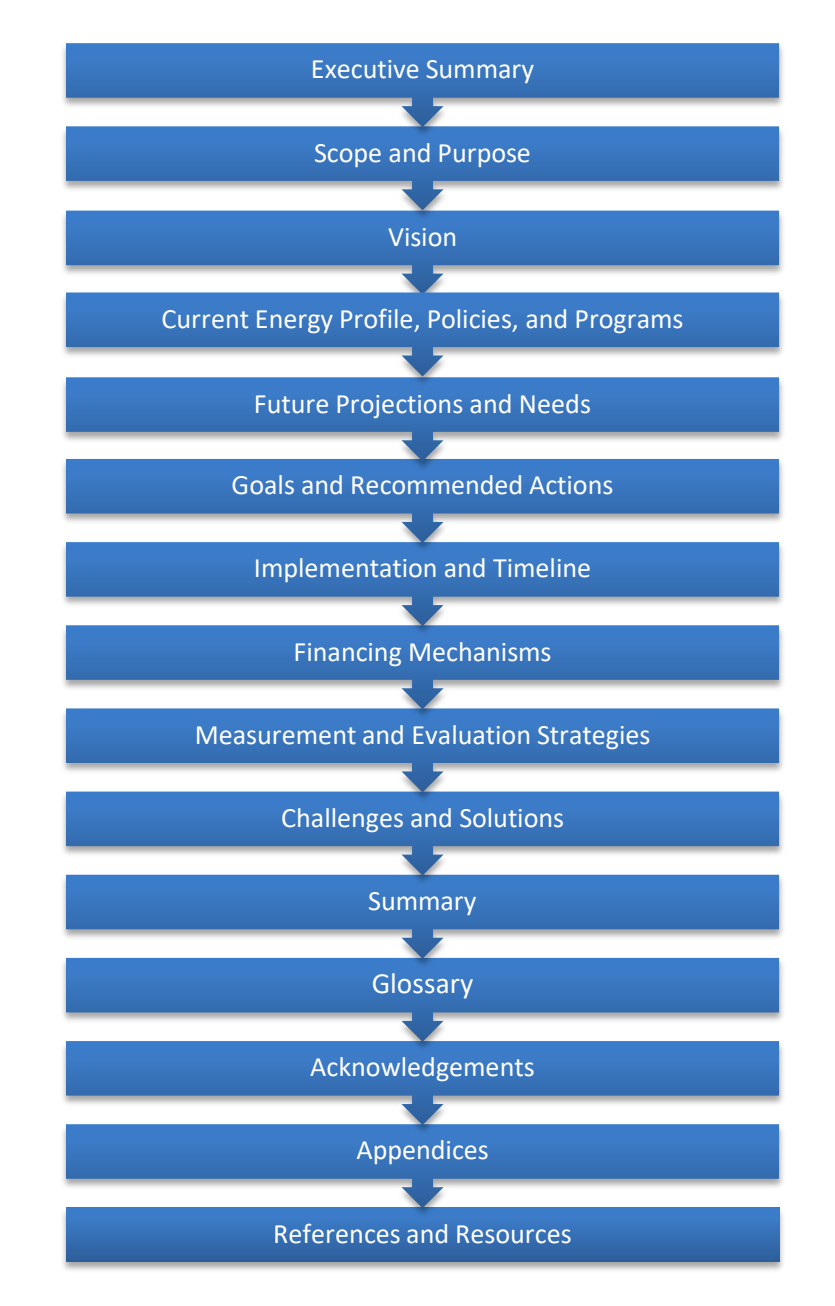
Figure 3. General Outline for a State Energy Plan

While these Guidelines provide direction for state energy planning teams in the overall development of an energy plan, this section provides an outline for the written plan itself. The content of a state energy plan will be unique to each state's forecasted energy needs and constraints, as well as state-specific political, economic, and social drivers. Although plans differ in the specific vision, goals, and recommended actions, the following general content considerations can be applied to any state energy plan (see Figure 3).